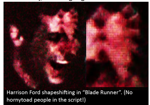
Harrison Ford shapeshifting in "Blade Runner". (No hornytoad people in the script!)