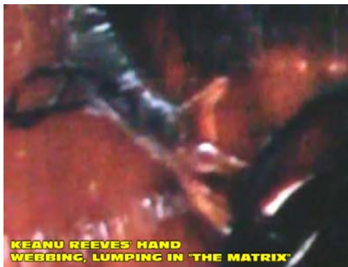
KEANU REEVES' HAND WEBBING, LUMPING IN "THE MATRIX"

I was indeed intimidated by all of this while at the same time hardly being able to believe it. From that time of February 14, 2013 with the start of this air vehicle harassment until now (August 2016) this form of psychological warfare has continued most every day and night. There have been times when it is less, and times when it is more, and certain days it does not occur, but it has continued consistently for these three and a half years.